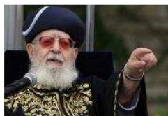
Zionist en | Politics Ovdia Yosef: May Abbas Perish from This World