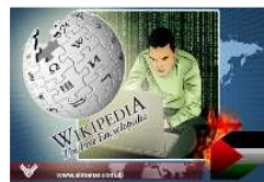
Palestine | Politics Palestinians Counter Israeli Editing Group in Wikipedia Battle