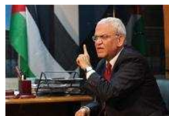
Palestine | Politics Erekat Says Israel Must Choose Peace or Settlements; Rejects Bi-Monthly Meetings